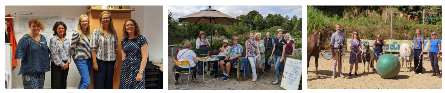
From left, our visits to Home-Start Blackmore Vale, In Jolly Good Company and The Horse Course

We'd like to thank Axminster & Lyme Cancer Support, The Horse Course, In Jolly Good Company, The GAP Project, Shaftesbury and District Dementia Friendly Community, Home-Start Blackmore Vale, Dorset Lavender Farm, Kinson & West Howe Foodbank, The Absolute Music Trust, It's All About Culture, Creative Kids, Water Lily Project, The Shine Project, Citizens Advice Central Dorset, The Harmony Centre and Escapeline, B Sharp, ASCape, Prout Bridge Project, The Powerhouse (Poole), for their warm welcome over the summer.